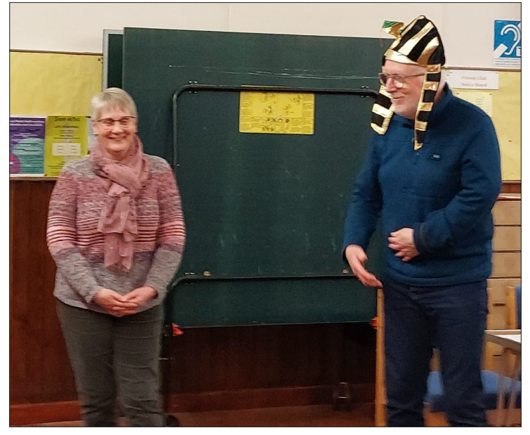
Welcome Worship Witness