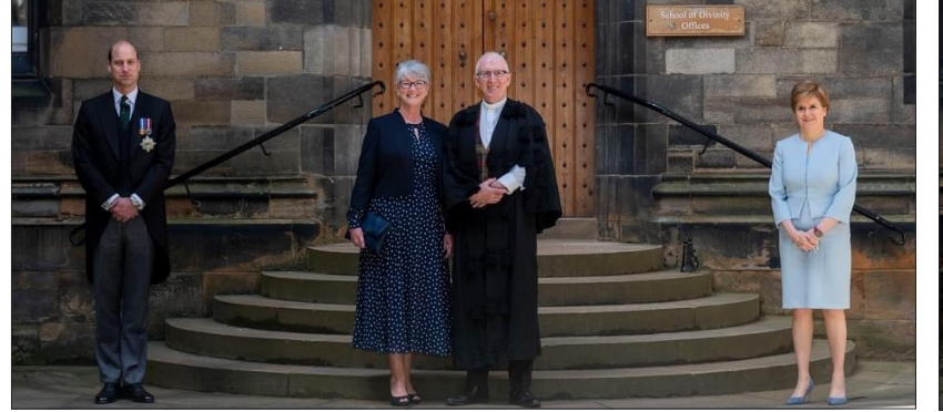
Welcome Worship Witness