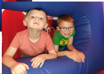
More Sunday Club kids enjoying the bouncy castle