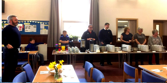
Boys Brigade Serving at their recent Soup Lunch