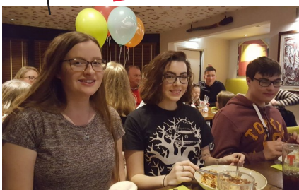
Older members of our youth group enjoying a meal at Roo's Leap