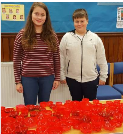
Poppies that our Youth Group produced for inclusion in a memorial for Remembrance week