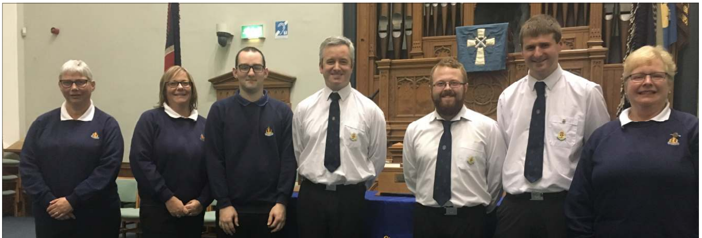
Below - BB Officers at the rededication service.