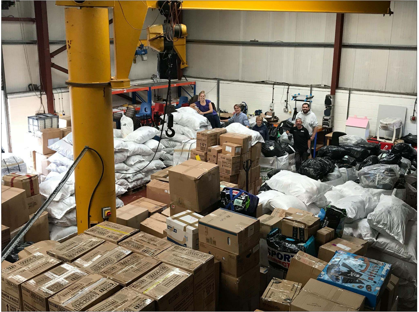
Preparations for Christmas in Malawi have to start early if all of this is to reach them in good time!