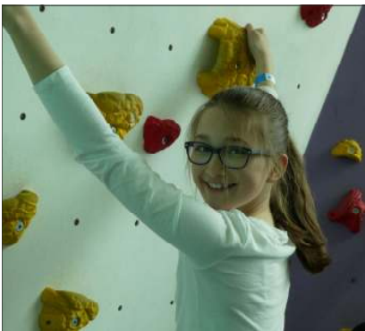
On the climbing wall.