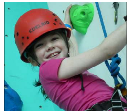
On the climbing wall