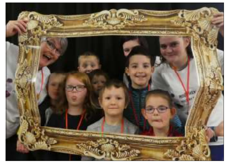
Group pictures - or "You've Been Framed"