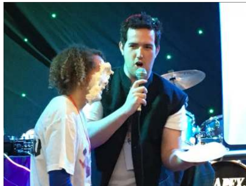
The dreaded 'Gunge Challenge'