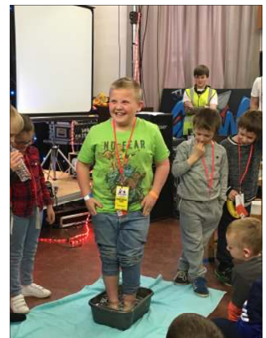
Very Cool Man!