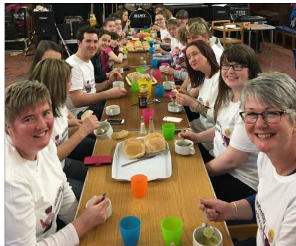
The Team having lunch