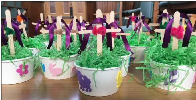
Bottom - Lunch Club work (see inside)