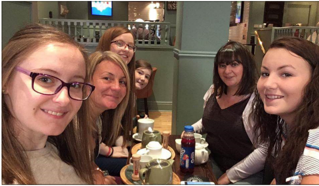
Left - Some of the group at Kilmarnock