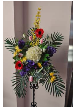
Our Flower club ladies produced wonderful displays for Easter