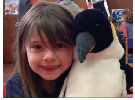
A young Polar Explorer