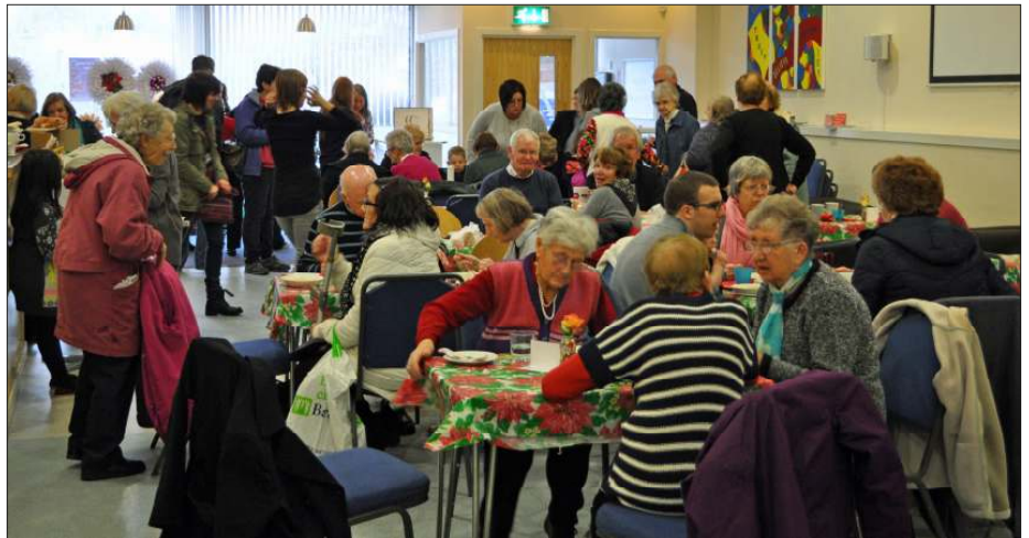
Members of RM Condor helping to load the Malawi container / Our Christmas Fayre in Community Spirit was very successful