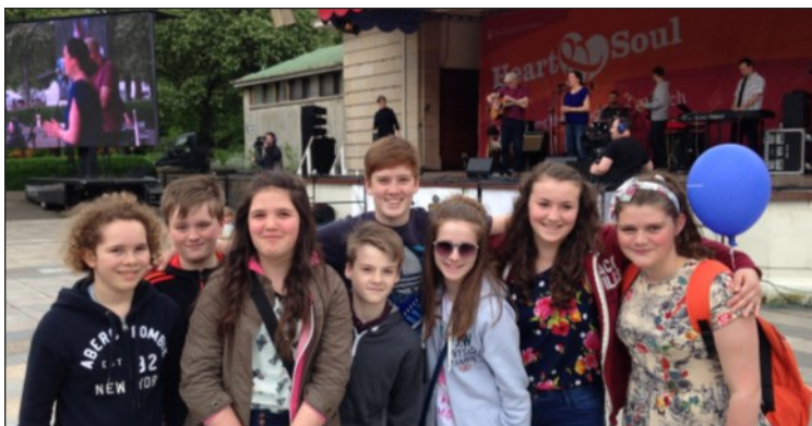
Our Youth Group had a great day.

Now in its third year, the Heart & Soul celebration didn't disappoint and the thousands who gathered in Princes Street Gardens, Edinburgh, left much inspired and having enjoyed a wonderful day of fun and fellowship, entertainment and worship.