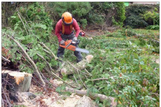
October - After a large branch had fallen into a neighbour's property, Royal Oak Tree Services felled the oversized trees in the manse garden - fortunately before the onset of winter gales!