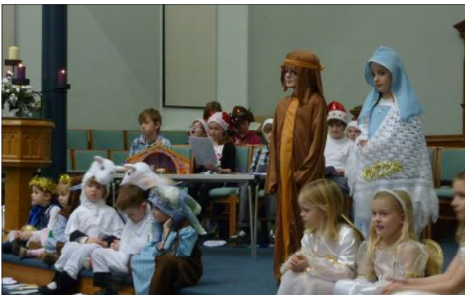
December - As always, the charming innocence of the children delighted us during their presentation of the Nativity play.