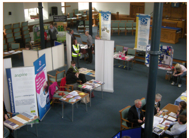
Above - The flexibility of our Sanctuary space was put to good use at this AVO conference.