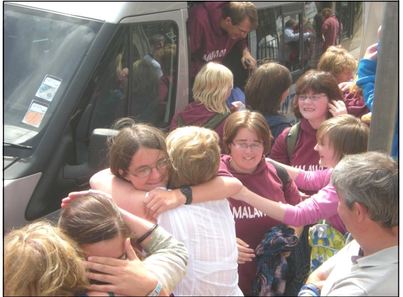
Joyous and tearful reunions with family and friends