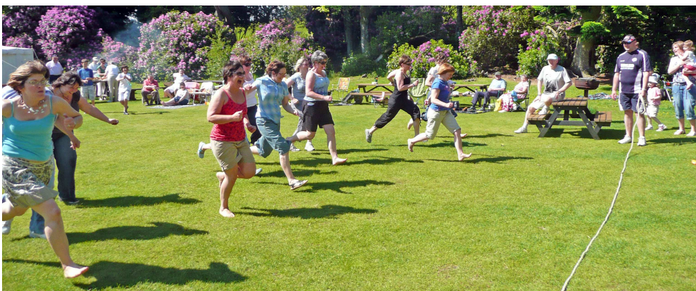
The Ladies' race being taken seriously / Even the editor tries to prove he is still young at heart!