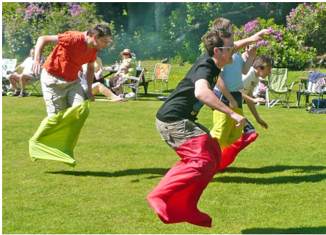
Bairns having fun!