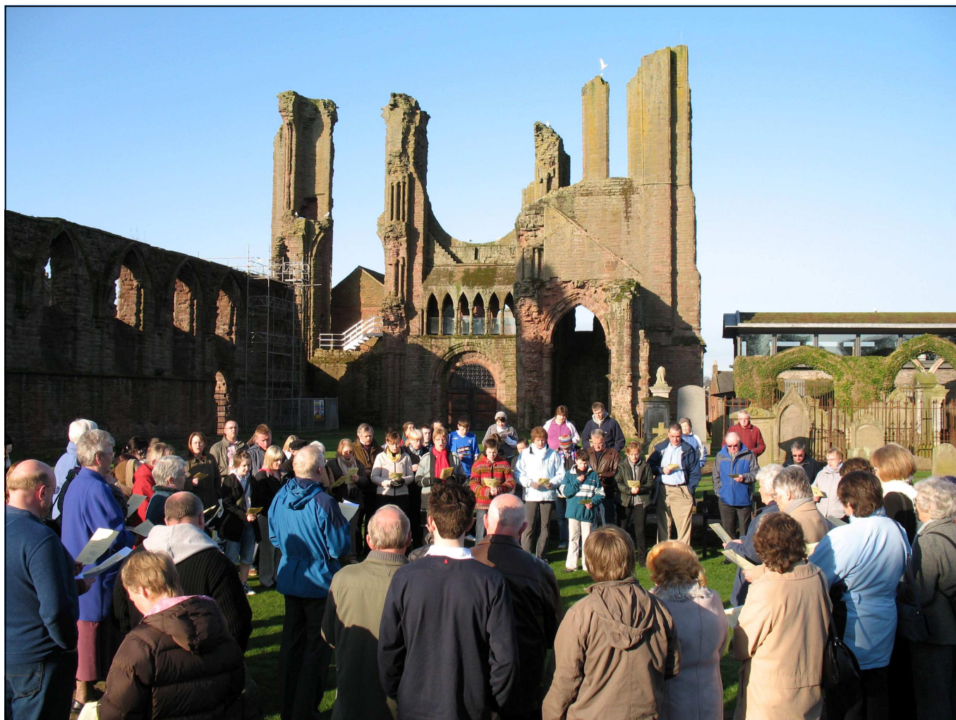
The Easter morning service in the Abbey - Our young people serving